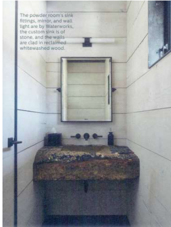
The powder room's sink fittings, mirror, and wall light are by Waterworks, the custom sink is of stone, and the walls are clad in reclaimed whitewashed wood.