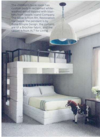
The children's bunk room has custom beds in reclaimed white-washed wood topped with blankets from Swans Island Company. The table is from RH, Restoration Hardware; the pendant is by Bone Simple Design; the curtains are of a Brochee fabric, and the carpet is from ALT for Living.