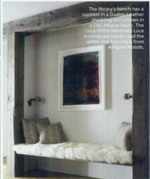
The library's bench has a cushion in a Dualoy Leather shearing and pillows in a C&C Milano fabric. The circa-1970s Martelli Luce sconces are Italian, and the white-oak flooring is from Arrigoni Woods.