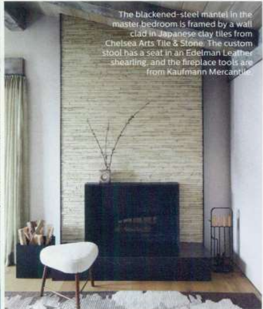
The blackened-steel mantel in the master bedroom is framed by a wall clad in Japanese clay tiles from Chelsea Arts Tile & Stone. The custom stool has a seat in an Edelman Leather shearing, and the fireplace tools are from Kaufmann Mercantile.