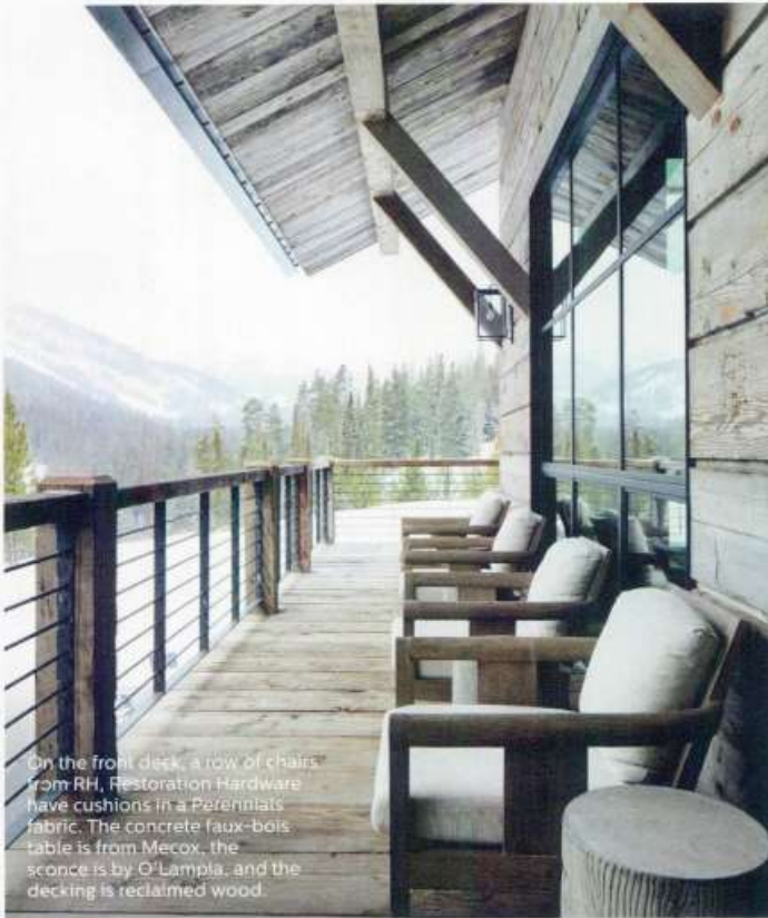
On the front deck, a row of chairs from RH, Restoration Hardware have cushions in a Perennials fabric. The concrete faux-bois table is from Mecox, the sconce is by O'Lampila, and the decking is reclaimed wood.