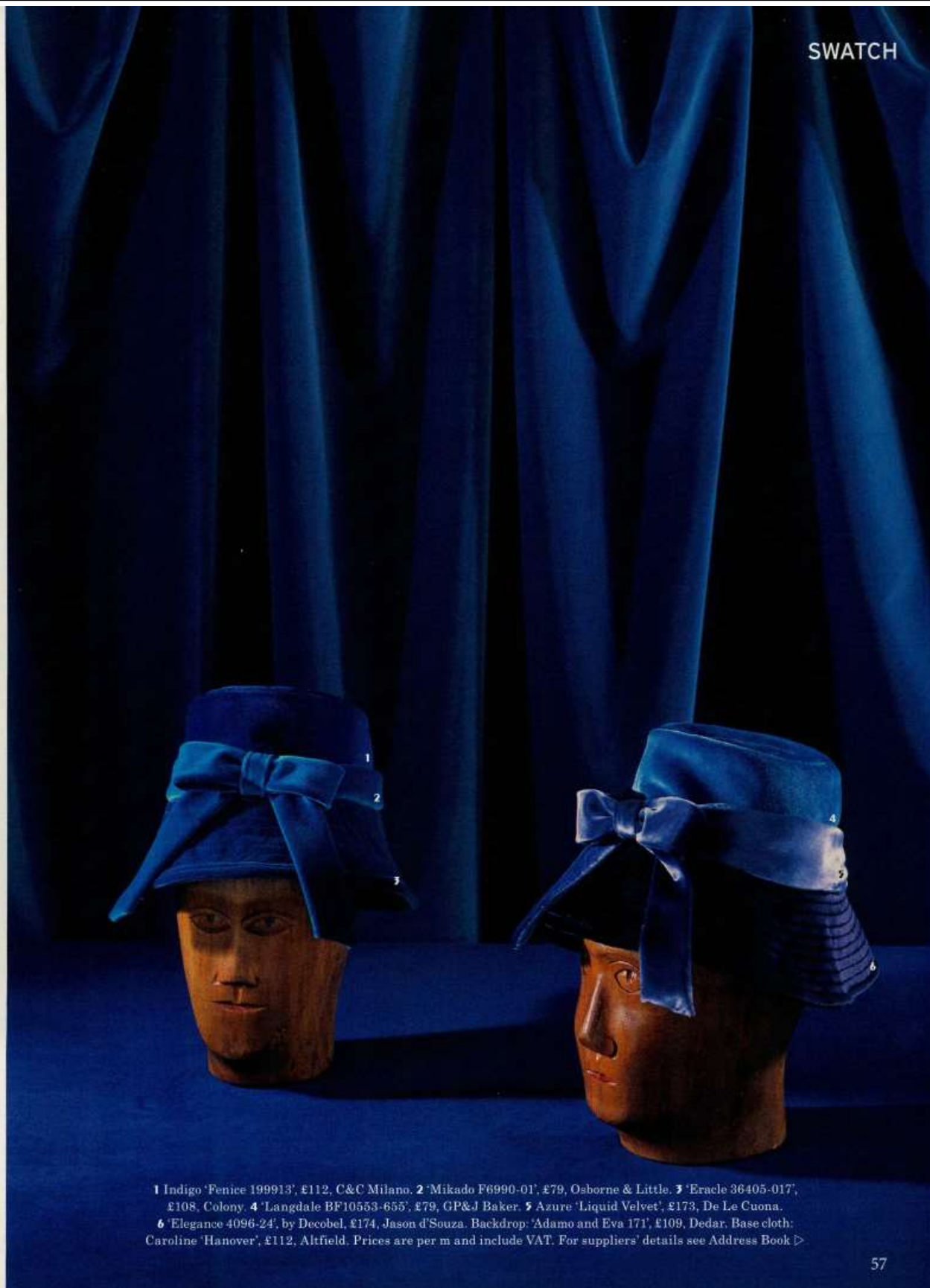
1 Indigo 'Venice 199913', £112, C&C Milano. 2 'Mikado F6990-01', £79, Osborne & Little. 3 'Eracle 36405-017', £108, Colony. 4 'Langdale BF10553-655', £79, GP&J Baker. 5 Azure 'Liquid Velvet', £173, De Le Cuona. 6 'Elegance 4096-24', by Decobel. £174, Jason d'Souza. Backdrop: 'Adamo and Eva 171', £109, Dedar. Base cloth: Caroline 'Hanover', £112, Altfield. Prices are per m and include VAT. For suppliers' details see Address Book >