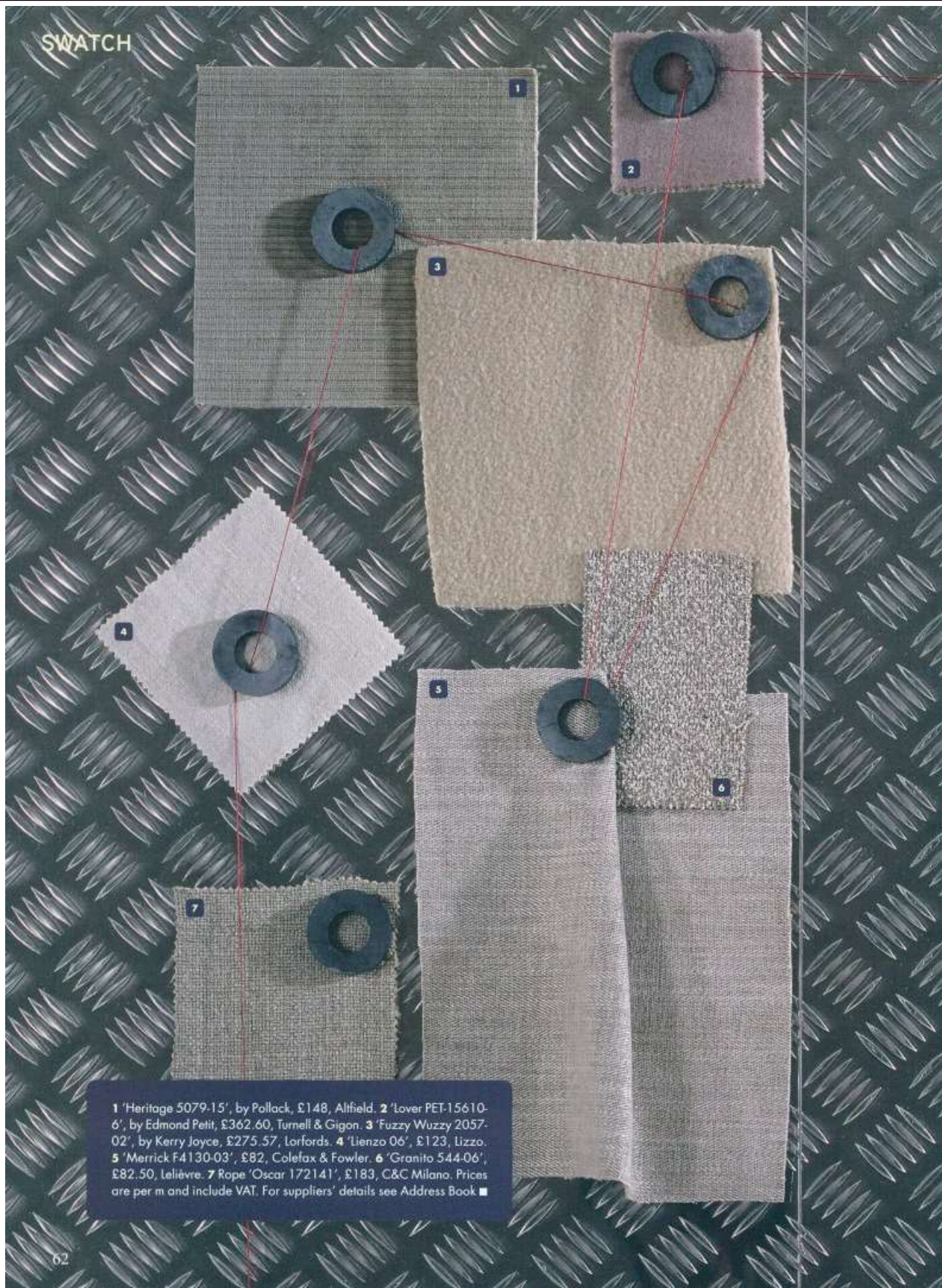
1 'Heritage 5079-15', by Pollack, £148, Allfield. 2 'Lover PET-15610-6', by Edmond Petit, £362.60, Turnell & Gigon. 3 'Fuzzy Wuzzy 2057-02', by Kerry Joyce, £275.57, Lorforde. 4 'Lienzo 06', £123, Lizzo. 5 'Merrick F4130-03', £82, Colefax & Fowler. 6 'Granito 544-06', £82.50, Lelièvre. 7 Rope 'Oscar 172141', £183, C&C Milano. Prices are per m and include VAT. For suppliers' details see Address Book ■