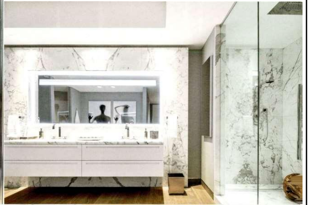
Opposite: Photographs by Rick Rose provide another (virtual) view in the master bedroom, with a sand effect bespoke rug in-vision. Top: Ultra-clear Starphire glass and a floating vanity with integrated LED lighting add cool in the Carrara marble-clad master bathroom. Bottom: Custom wall panels pair with rift-cut oak in another bedroom.

MIAMI: ANGELO SOIAS; A. SAMUEL; AT JEFFREY MIDWEST: TONY FABRIC; CUSTOM ARMCHAIRS: MILANO; PHOLSTERY: STRAIGHT SOFA FABRIC; KELLY WEARSTLER; AT MONICA JAMES & CO.; BARREL CHAIRS: MERIDA; RUG: LIVING AREA; PHILIP MICHAEL; WOLFSON; COFFEE TABLE: ROBE/CARA; NESTING TABLES: CURVED COCKTAIL TABLES: WILLIAM HAINES DESIGNS; GARDENERS: LUMBER; RECREATIONAL TABLES: JAY SCOTT'S COLLECTION; PLANTERS: ROMO; AT MONICA JAMES & CO.; CUSTOM BARREL BACK CHAIRS: GUEST BEDROOM; FLOS; AT LUMENS; STONE: KUSTOM; BOPPY; LACINOTTO; ARTISERIOS; PINGPONG TABLES: KELLY WEARSTLER; ITTOBI; DORNBRACHT; TANK; SITTING: SITTING AREA; BELLY; CUSTOM; SHANDLER; ROBE/CARA; TABLE; SIDEBOARD: KELLY WEARSTLER; AT MONICA JAMES & CO.; CHAIRS: DELIGHTFULL; SCONES; MASTER BEDROOM; TIM THOMPSON FABRICS; HEADBOARD: FABRIC; ROBE/CARA; BEDSIDE CHESTS; CUSTOM COUTURE RUGS; CARPET; BEDROOM GUEST BEDROOM; KELLY WEARSTLER; SCOTCHES; THROUGHOUT ES WINDOWS; FLOOR-TO-CEILING WINDOWS; APURE; CEILING LIGHTS; DIXON; ROOM; BATHROOM; HOUSE OF LINEN; BEDROOM FLOWERS